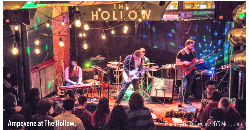
Ampevene at The Hollow.