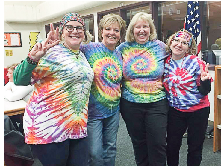
2017 competitors The Hip Bees, from Eagle Elementary.

Teams, who are encouraged to don costumes to show team spirit, enter the bee by making a contribution of $120. Sponsorships are also provided by local businesses, community groups and other organizations, for teams with limited funds.