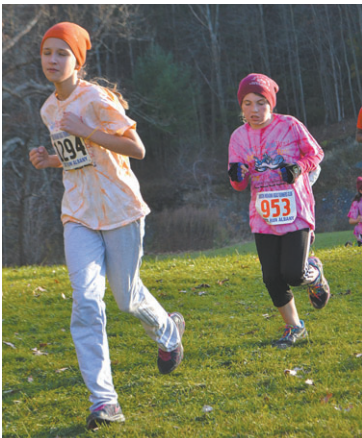
ABOVE: A dozen Capital District elementary schools, including three from Guilderland and St. Thomas from Bethlehem, participated in the Just Run track meet at Tawasentha Park in Guilderland on Nov. 6.