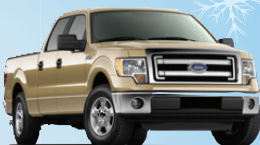
2013 F-150 XLT

Security deposit waived. Taxes, title and license fees extra