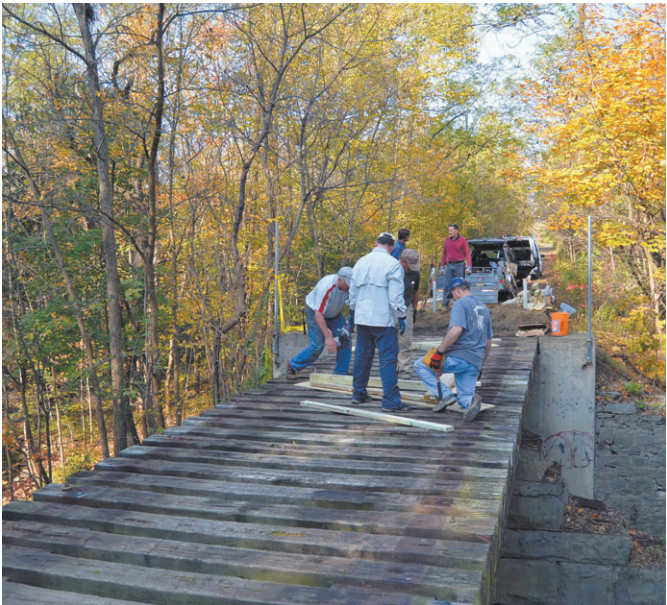
LEFT: Vly Creek bridge improvements along the Helderberg Hudson Rail Trail in Voorheesville were completed in the fall as part of an effort to open a new 3-mile trail section.