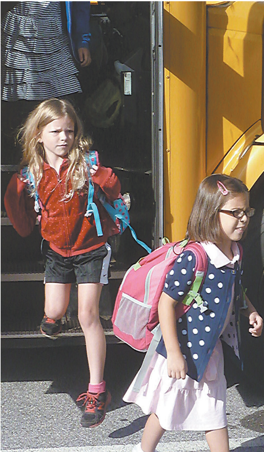
RIGHT: Slingerlands Elementary School students were excited for the first day of school as they rode the bus or were dropped-off by parents. All Bethlehem Central students had their first day of school on Sept. 9.