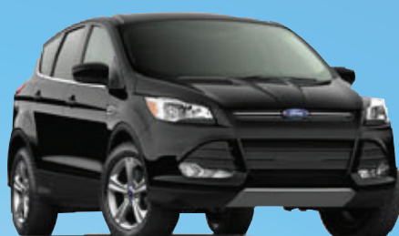
2014 ESCAPE SE AWD 1.6L EcoBoost

Security deposit waived. Taxes, title and license fees extra