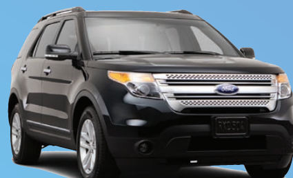
2014 EXPLORER BASE 4x4 w/SYNC & Sirius

Security deposit waived. Taxes, title and license fees extra