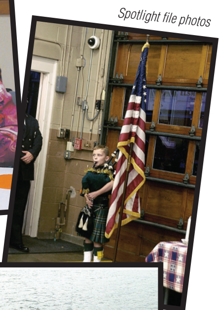
Spotlight file photos

During the second half of 2013, clockwise from top left, Girl Scouts in Bethlehem made fabric flowers for seniors, the Selkirk, Elsmere and Delmar fire departments marked 9/11, the Two Row Wampum flotilla made a stop at Henry Hudson Park and Bethlehem held a two-day camp for seniors. For more photos from 2013, see page 10.