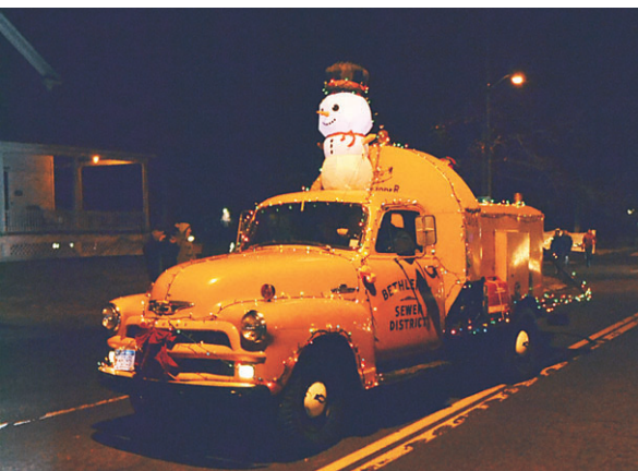
ABOVE: The Bethlehem Holiday Parade was held Dec. 6, stepping off at Town Hall for the brief march to the Four Corners in Delmar. Several community groups participated.