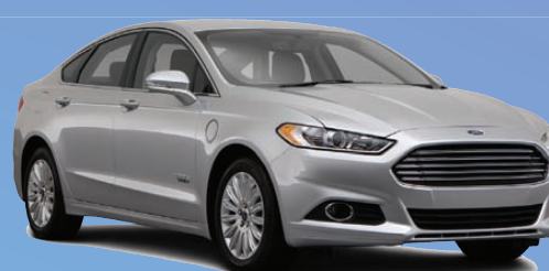
2014 FUSION SE

Security deposit waived. Taxes, title and license fees extra