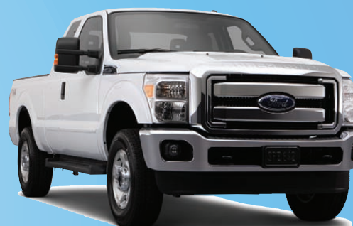
2013 FORD SUPER DUTY