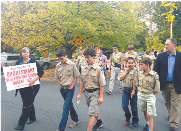
ABOVE: Boy Scouts from Bethlehem Troop 75 spoke out against the town's temporary sign law on Oct. 9 at Town Hall. The troop said they believe profits from their annual fundraiser went down 15 percent the previous year because they lost prime advertising space.