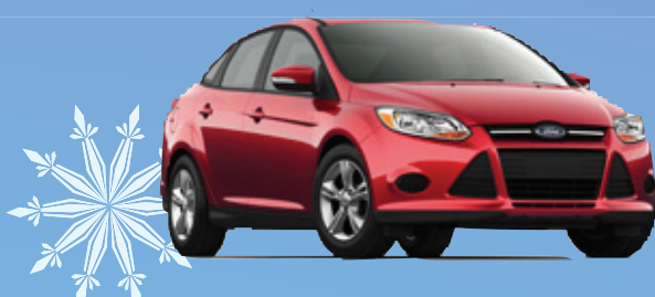
2014 FOCUS SE w/SYNC & Sound